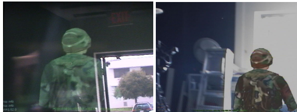
Figure 2. Non-occluding and occluding displays

The type of head-mounted display used can make or break the illusion of computer-generated forces existing in the real world. If the graphics do not occlude the real world, they do not appear solid or realistic. Instead, the graphics, translucent on a non-occluding display, take on a ghostly and unrealistic appearance. Figure 2 shows two similar scenes, one through a non-occluding display, and one through an occluding display. Notice how the avatar is washed out in bright light in the non-occluding display.