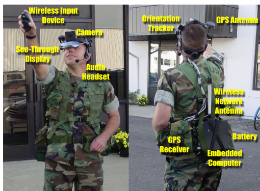
Figure 1. The BARS Wearable System

The centerpiece of the BARS project is the capability to display head-up battlefield intelligence information to a dismounted warrior, similar to the head-up display (HUD) systems designed for fighter pilot cockpits. The system consists of a wearable computer (PC-compatible), wireless network support (802.11b), and a tracked see-through Head Mounted Display (HMD) (Sony Glasstron, Microvision Nomad, or Trivisio). Three-dimensional (3D) data about the environment is collected (through surveying, sensors, or reports by other users) and made available to the system. By using a Global Positioning System (GPS) unit and an inertial orientation tracker (such as the Intersense InertiaCube) it is possible to know where the user is located and the direction in which he is looking. Figure 1 shows the BARS wearable system. Based on this data, the desired 3D data is rendered to appear as if it were in the real world.