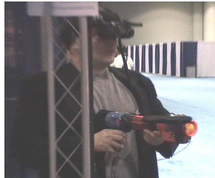
Figure 5. A conference attendee tries the system.

User reaction to the training system was generally positive. Many users who have been through MOUT training liked the concept and the initial implementation.