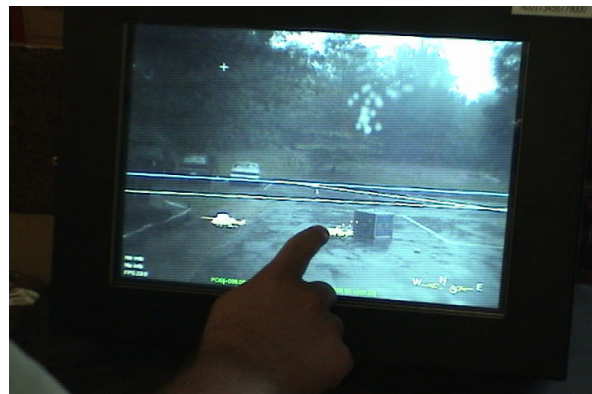
Figure 9. The instructor designates an effect on a virtual target.

For this demonstration, all equipment was loaded onto a handcart and powered by large batteries. We chose this path to keep the demonstration running all day and to accommodate a lot of attendees wanting to try the system—it's a lot easier to put on a helmet than an entire wearable backpack. The observer's training system can easily run on the wearable backpack shown earlier in Figure 1, while the instructor station can be "compacted" onto a single tablet PC with an attached camera.