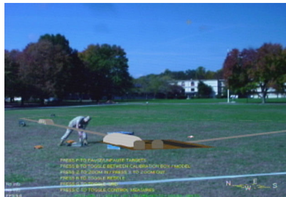
Figure 4. An assistant marks where round landed.