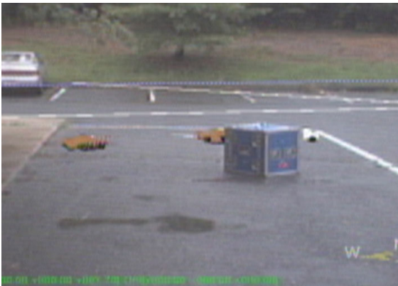
Figure 10. A real-world object (blue box) occludes a virtual tank and truck.

One of the primary features of training in the real world using augmented reality is the ability to model the real world training area and properly occlude virtual entities as they move through the environment. In the case of this particular training area, because it was a flat field, there were no significant terrain features to model. To demonstrate occlusion