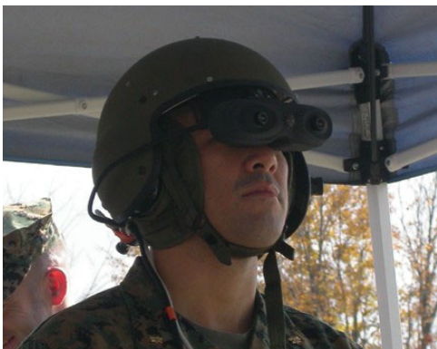
Figure 7. The trainee wears a head-mounted display to see the virtual targets.

The observer wears a helmet-mounted HMD, as seen in Figure 7, to provide a tracked, augmented view of the training area. This HMD is connected to a laptop computer that drives the visuals. The HMD contains cameras just ahead of the user's eyes that collect video to be augmented. On the rear of the HMD (not visible in Figure 7) sits a rear-facing camera used for high-precision video-based tracking—this camera captures images of a set of graphical markers placed behind the user and calculates the position and orientation of the user's head. With the high-precision tracking, the user can look all around the training area and the virtual targets appear to remain fixed in the real world. The user interface consists of just three operations: controlling the zoom level, turning the reticle on and off, and turning a virtual grid on and off. The observer's portion of the system is simple to operate and allows the trainee to concentrate on the task and not the equipment.