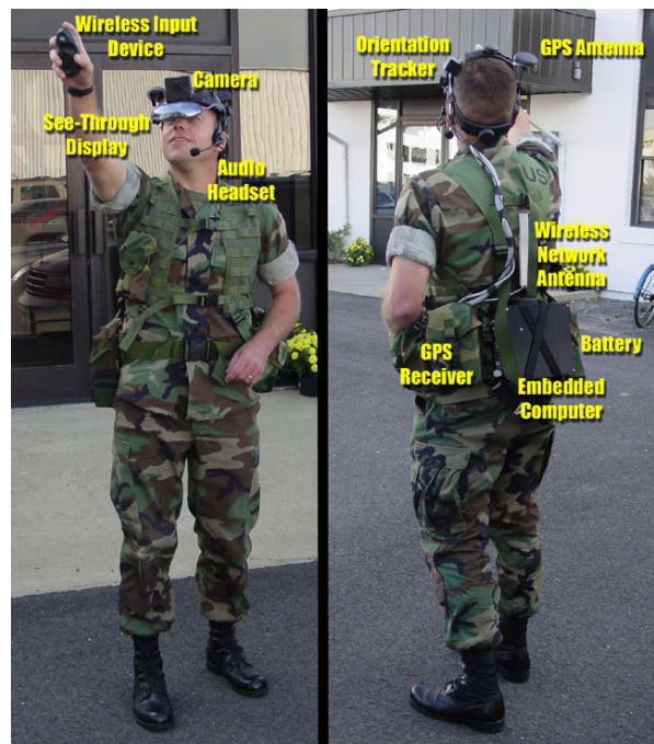
Figure 1. A Wearable Augmented Reality System

1995). Live entities are real people and vehicles participating in a training exercise; virtual entities are human-controlled players in virtual worlds; and constructive entities are driven by algorithms in computer simulations. AR provides a natural way for all three types to mix together. Live entities observe virtual and constructive entities through the AR system. Interactions such as the user’s movements and weapon usage are conveyed from the AR system back to the constructive and virtual simulation systems. Fire Support Team Training is a prime venue to insert virtual and constructive entities to combine with live fires.