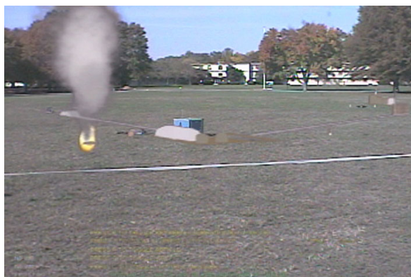
Figure 5. The real round was determined to have destroyed the virtual target.