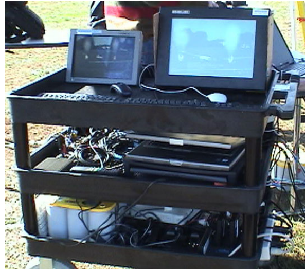
Figure 8. The instructor's station.

The instructor uses a station with a large, bright touch screen attached to a laptop computer. The instructor can start and stop the virtual targets, designate effects on the targets, and reset the simulation, through a few options on the touch screen display. Again, the focus was on simplicity: when the instructor wants to designate an effect on a target, he selects the effect