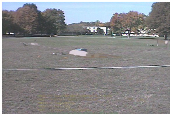
Figure 3. An augmented view of the training area.